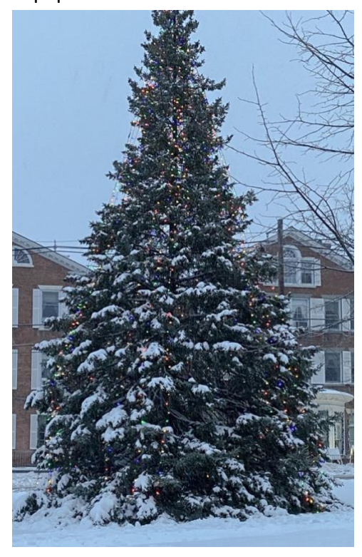
Middlebury Memory Tree

The Middlebury Lions started their Memory Tree project in the mid-1970s. For one dollar per bulb sponsored, they usually have over 900 subscribers, whose names they print in a full-page advertisement in the local newspaper.