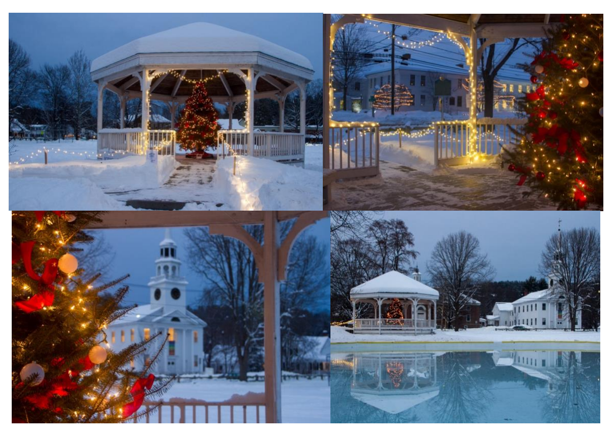
Memory tree with other Norwich lights

Participants were invited to memorialize those who are special to them with a downloadable form or a note to be delivered by mail or in person to Norwich's town clerk, Bonnie Munday, who kindly offered to compile the memorials on a poster for display in front of the Norwich town hall in the New Year.