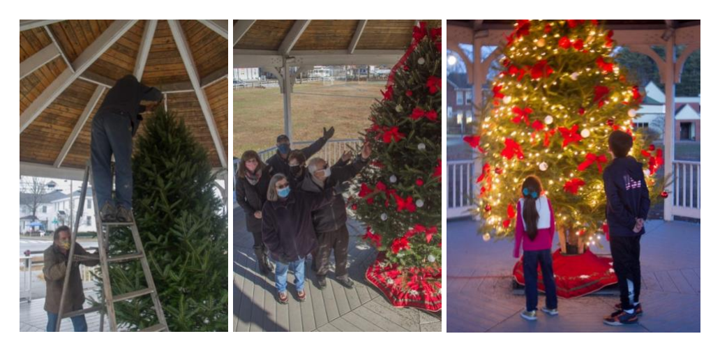
Erection and decoration of the tree, followed by admiration of the lights

Norwich has had a memory tree since 1979, starting with the efforts of dedicated Norwich Lions and continued to this day with spearhead the acquisition, placement and decoration of the tree.