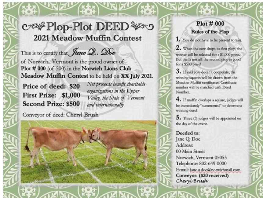
Sample of the 2021 deed

In 2021, Meadow Muffin sales go on line with a colorful new deed. We look forward to having our neighbors join in the fun of the contest—one with high rewards and good odds—to benefit our community.