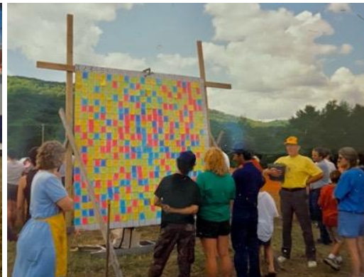
Attaching purchased squares to the display board and announcing the results