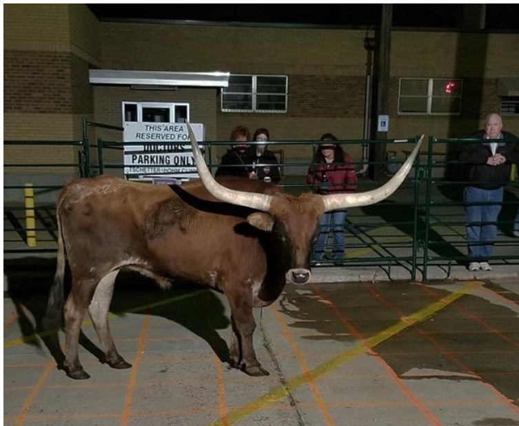
An impressive bull-sh*tter!

The Huron Daily Plainsman reports that the Huron Elks Lodge holds an annual “Cow Pie Drop contest”. We think that it’s a mistake to assume that long horns produce a better product!