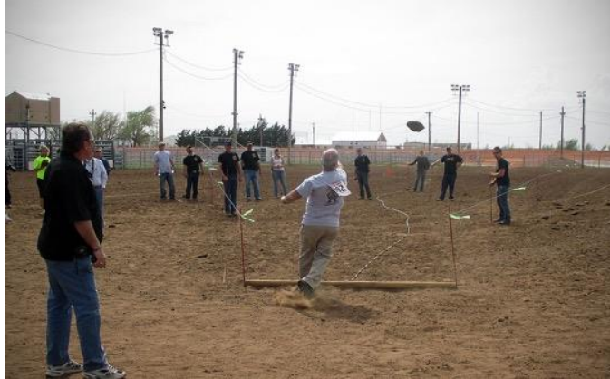
At the World Championships of Cow Chip Tossing

The early Meadow Muffin contests were conducted by selling numbered “deeds”, whimsical in design to make participation fun and memorable.